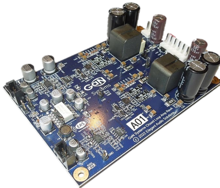
Figure 1 GS-EVM-AUD-AMPCL1-GS Evaluation Module